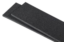
iM2450TPDIV Extra TrekPak Dividers