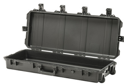
iM3100-X0000 No Foam