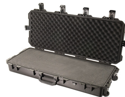
iM3100-X0001 With Foam